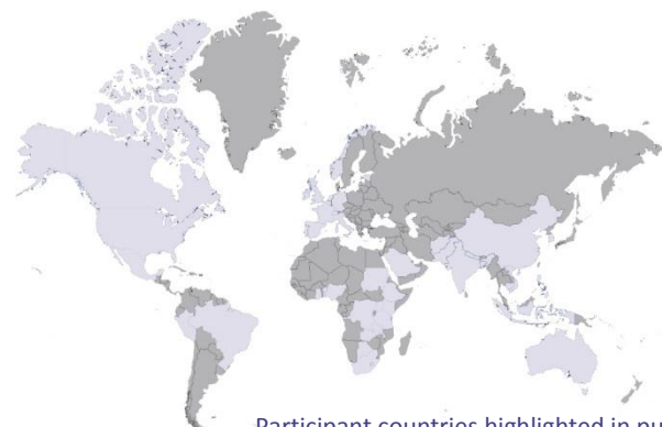
Participant countries highlighted in purple.

"Thank you for a wonderful 2 weeks. As a public health nurse and researcher I am enlightened and energized to continue to advance future work in the field of TB research and programming." – 2018 Summer Institute participant